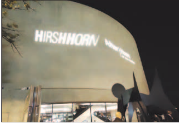
The Hirshhorn lights up for a night at the museum on Oct. 14.

"Andy Warhol: Shadows," the Hirshhorn's current premier exhibit, looks a little different when adjacent to the flashing lights of a Latin-